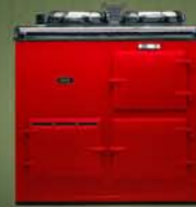
POST BOX RED