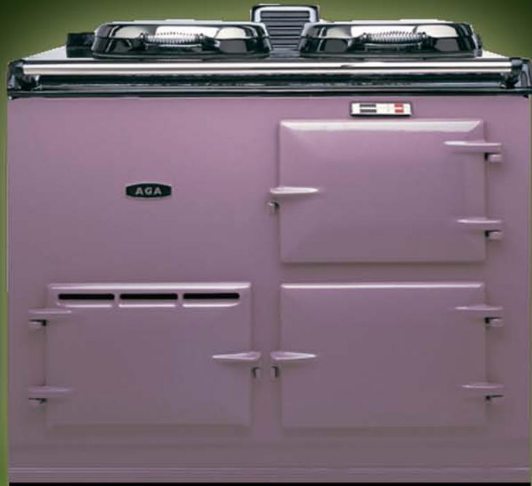
Original oil shown for illustration only

Available in oil, natural or lpg gas, 13 amp electric or solid fuel