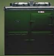
BRITISH RACING GREEN